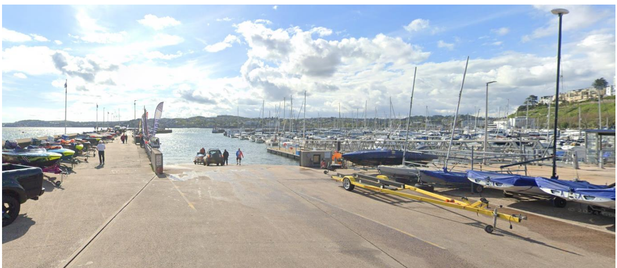
Images by Tania Hutchings – 50 Degrees North Photography and Sportography TV Google maps Google Streetview